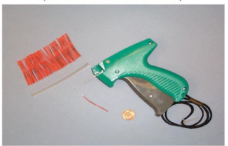
Tagging Gun and T-Bar Tags (top photo); Stainless Steel Dart Tag and Applicator (bottom photo) (Note: coin for scale – 0.75 inches diameter)